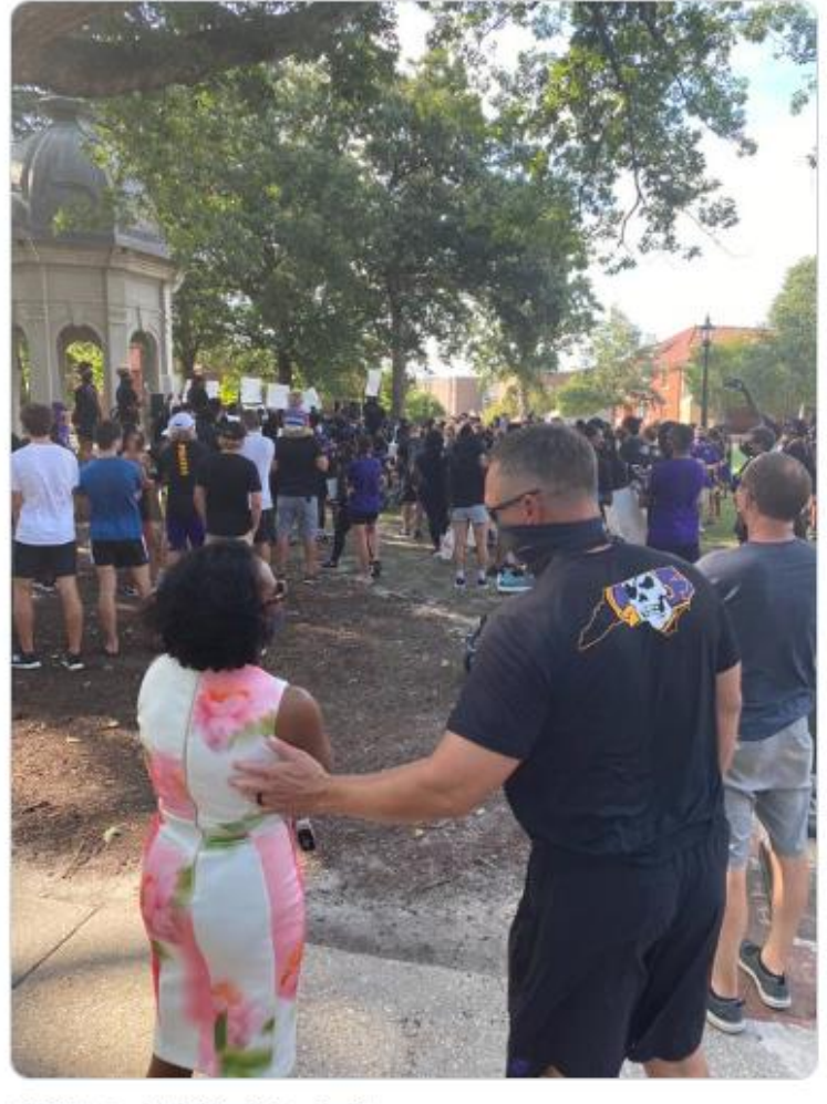
4:26 PM · Aug 31, 2020 · Twitter for iPhone

So proud to be with @ECUCoachHouston and our coaches and student athletes in a peaceful protest on our campus. Make your voices heard and create positive change @EastCarolina and around the world.